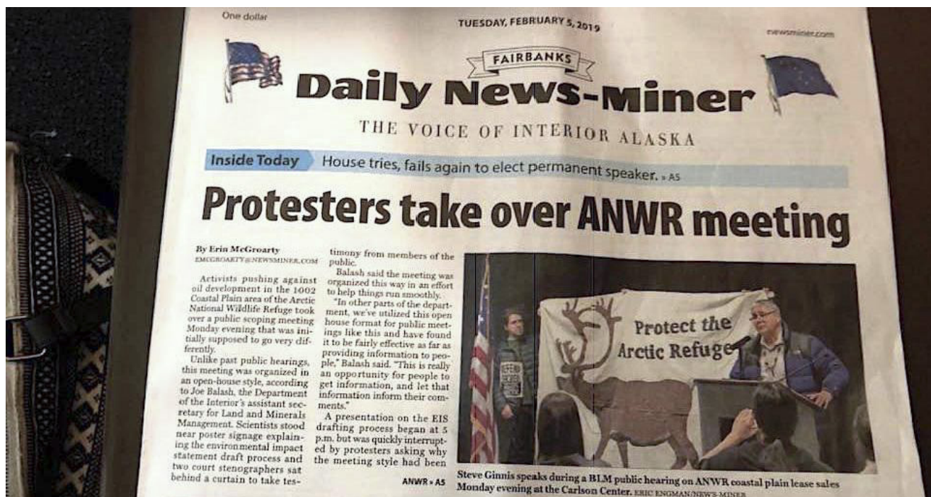
Front-page article on the Arctic Refuge Public Hearing in Fairbanks, Fairbanks Daily News-Miner , February 5, 2019.

When the BLM announced its plans on January 30, 2019, the agency failed to respond to the requests from the coalition and instead offered a much shorter extension until March 13. The BLM also announced only one public hearing outside of Alaska—again, as during the scoping phase, in Washington, DC. But this second round of hearings was structured on an even more compressed timescale to invite even less public input. The BLM stipulated that all public hearings be finished within a much shorter window of time—starting on February 4 and ending on February 13—and that the first hearing would happen just two business days after the announcement, not the two-week notice requested by the coalition. These decisions underscore the Trump administration's rampant and repeated efforts to stifle public participation in the process.